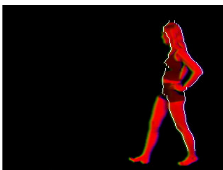
Fig. 3: The outline of the area of interest in a sample frame.

This outlining was achieved using an automatically initialised snaking algorithm. At the ankle height of the subject, an XT slice was obtained and an initial approximate of the snake was fit to the braided image. This initial template was then warped to follow the pattern's edges. Because of the similarity of the braided patterns at locally connected slices, this initial snake fitting was performed only once. After that, the snake fitting process was repeated at each slice from the ankle to the head of the subject and the result of the snake fitting from the previous height was used as the initialisation at the next. This resulted in a complete outline of the tracked region, which is held throughout the video sequence (see Figure 3).