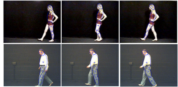
Fig. 4: Sample frames from the gait laboratory video sequence and the natural-environment video sequence, showing the simple ellipse model attached to the images of the subjects.

Shown in Figure 4 are some sample frames from the two video sequences with the simple ellipse body model attached. Note the significant difference in picture quality and contrast between the two sequences yet despite this, there is little difference in the accuracy of the model fitting. However, because the leg is not directly visible in the second sequence, there is an unavoidable ambiguity with regard to the dimensions of the limb segments. In the graphical results, we plot the orientation of the segments throughout the sequence and so this ambiguity will not affect the gait measurements – another advantage of this ellipse-based method.