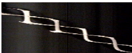
Fig. 2: The periodic pattern of the legs in motion in a sample XT slice.

This image is particularly useful for recognizing and analysing walking because of an interesting characteristic of the leg motion. In the case of a sagittal view of a human walking in front of a stationary camera, a distinctly recognisable braided pattern is observed in slices around the leg height (see Figure 2). The braids are formed by the periodic motion of the legs as they pass through the swing and stance phases of the gait cycle. While the legs appear very close to each other in the XY plane, causing occlusion and interference, in the XT plane they are very clearly distinguishable. If these two patterns can be outlined separately in the slice, the two legs would be separated from one another throughout the video sequence.